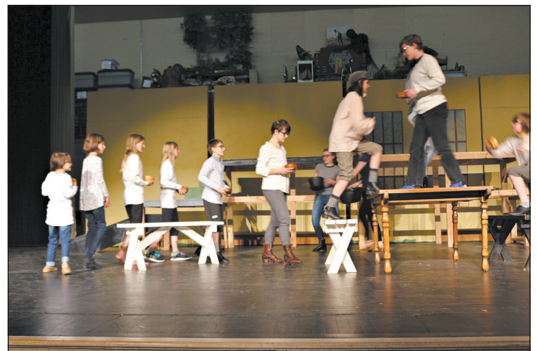
Students from Manitou Springs Middle and Elementary schools will be included as cast members in this year's production.

The high school band and orchestra students are contributing by providing the music.